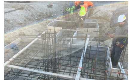
Above: Foundation work at new Science towers.

PHASE 1 (COMPLETE): MOBILIZE, SITE ENABLING, RELOCATION OF MODULARS