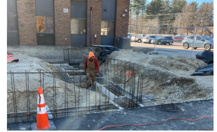
Above: Foundation work at new Science towers.