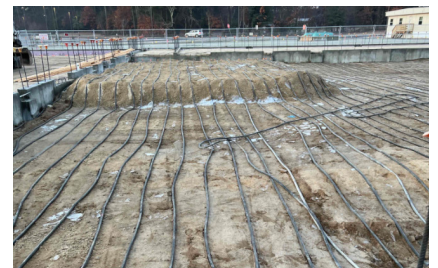
Above: Ground heating to do underground and slab work.